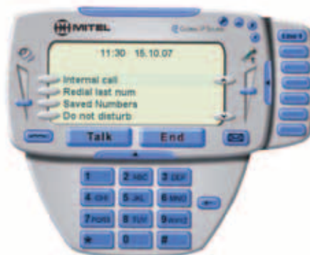
Mitel 5110 Softphone